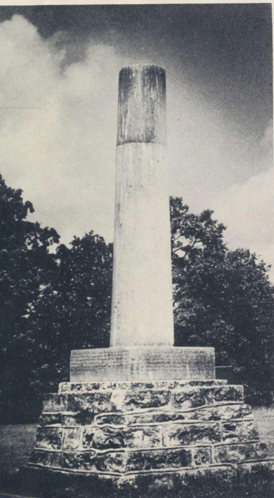
Grave of Meriwether Lewis

Trace, where travelers found food and shelter.