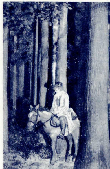
Lewis on the Natchez Trace. From the museum diorama.

Early in 1807 President Jefferson appointed Lewis Governor of the Louisiana (later Missouri) Territory. Arriving at St.