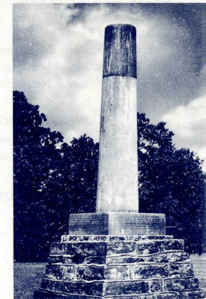
Grave of Meriwether Lewis.

Grass-covered rubble and a metal tablet mark the site of this inn. It was a rude frontier establishment, similar to a dozen others on the Natchez Trace, where travelers found food and shelter.