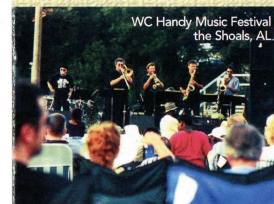
WC Handy Music Festival the Shoals, AL