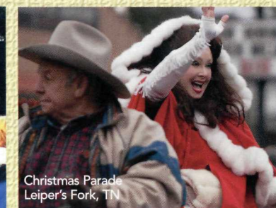
Christmas Parade Leiper's Fork, TN