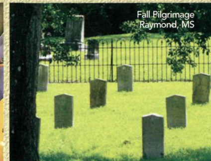
Fall Pilgrimage Raymond, MS