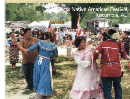
Native American Festival Tuscumbia, AL