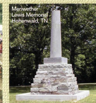
Meriwether Lewis Memorial Hohenwald, TN