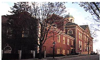
New Bedford Whaling Museum

Tour historic buildings, gardens, and museums. Attend cultural events and festivals. Walk cobblestone-lined streets in the Waterfront Historic District.