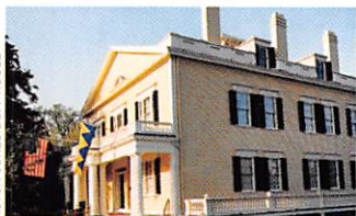
Rotch-Jones-Duff House and Garden Museum

Discover the stories of whaling merchants and maritime workers and the days of Herman Melville and Moby Dick .