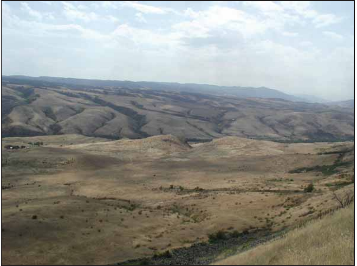
White Bird Battlefield as seen from the overlook on Highway 95.