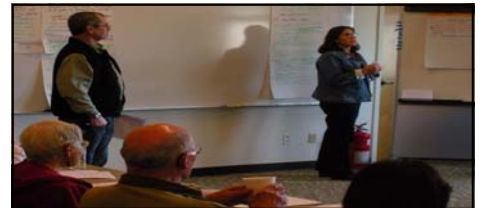
The Nevada appropriation has helped fund significant Partnership projects like the Board's strategic planning process.

thanks and appreciation to the State of Nevada for their support!