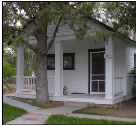
Shady building is no place to rest.

Service ranger station. This locally significant building was designed