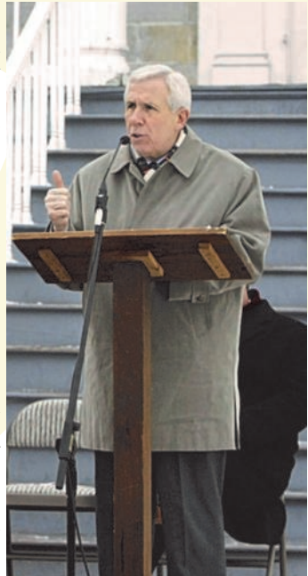
Congressman Frank Wolf at the dedication of the Cedar Creek and Belle Grove National Historical Park