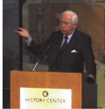
Noted historian and author David McCullough speaking at the conference

In June 2003 the Battlefields Foundation was pleased to be a co-sponsor of the International Heritage Development Conference in Pittsburgh, a collaborative effort of the Alliance of National Heritage Areas, many of the 24 national heritage areas, the National Park Service, and others. Almost 370 participants from four continents attended the four-day conference. The Foundation organized and/or participated in four of the conference sessions. The overall theme showcased successful examples of using history as an economic development tool.