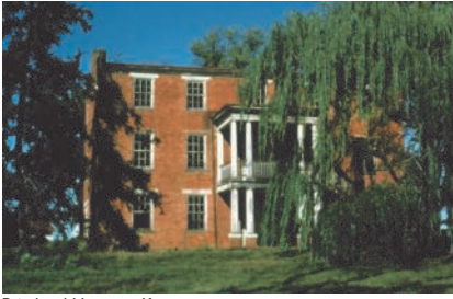
Pritchard House at Kernstown

In 2003 the Foundation awarded grants to 18 partners totaling $142,340 for projects that will help implement the District's Management Plan. The Battlefields Foundation's grants are funded primarily from its annual federal appropriation. Through the grants program, the Foundation shares this federal funding with partner organizations. So far the Implementation Grants program has leveraged more than $2.2 million for projects throughout the Shenandoah Valley. (Please see page 5 for a list of 2003 grants.)