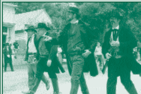
Wild West Day at Ushers Ferry.

If you would like more information on Ushers Ferry visit their website at www.cedar-rapids.org/ushers or call 319-286-5763.