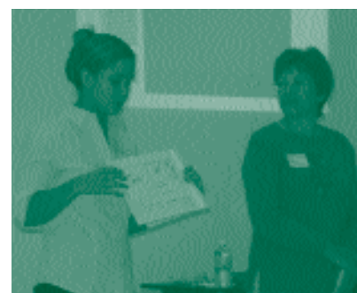
Participants showing off interpretive signs they developed for their site.