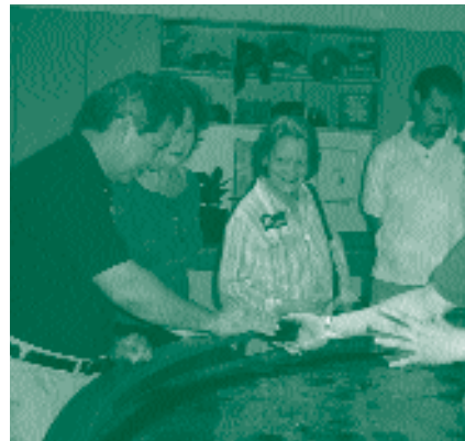
Visiting the National Mississippi River Museum & Aquarium.

Because we could not possibly tour the entire Heritage Area, Silos & Smokestacks hosted an evening reception at the Grout Museum in Waterloo. Nearly fifty Heritage Area stakeholders