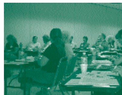
20 sites participated in the workshop held earlier this summer.