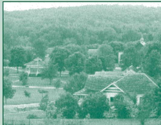
Scenic view of Ushers Ferry.

The Village is named for an early ferryboat operation that was established by the Usher Family in the late 1830's. The property was then purchased by the city of Cedar Rapids in 1966, and the idea for the creation of a Pioneer Village was developed in 1973. In 1986, Pioneer