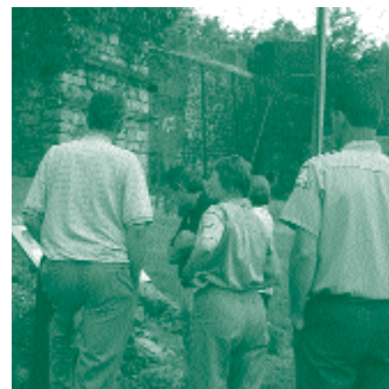
Visiting Hurstville Lime Kilns in Maquoketa.

impressed with the warmth, dedication and enthusiasm displayed by everyone I met. The regional stories are rich with spirit, determination and a willingness to work hard, traits that I saw in every handshake, exhibit and demonstration. The National Park Service, especially the Midwest regional office, is honored to