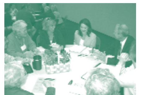
Great ideas came from the round table discussions held Wednesday morning.

Watch the next newsletter for information on the 2006 Annual Conference!