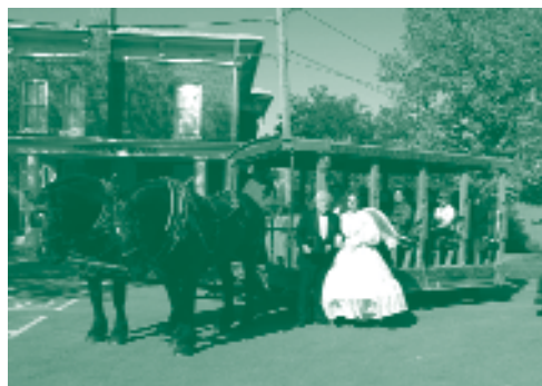
Trolley ride of historic downtown Waterloo.