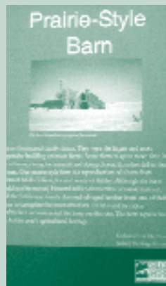
Sign outside Prairie-Style Barn

For more information, visit www.ackleyheritagecenter.com or call Bev Ryken at (641) 847-2201 Jim Daggs at (641) 847-2405.