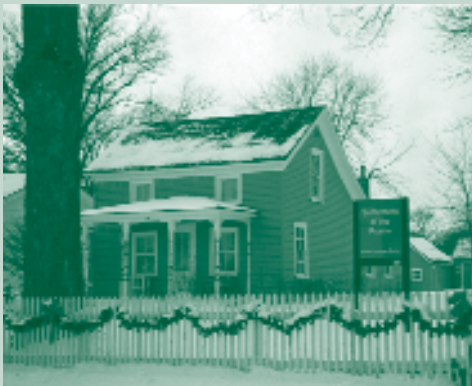
The Settlement of the Prairie's I-house