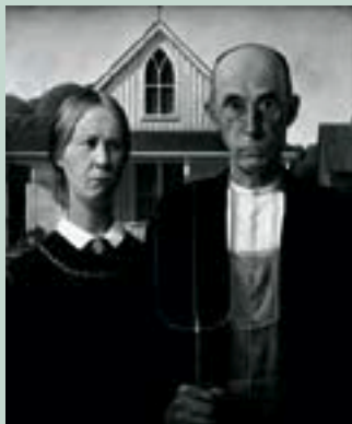
Wood's American Gothic

illustrations and a collection of household objects and furnishings are also on display. These pieces, combined with more than 170 works of art from the Cedar Rapids Museum of Art, come together to form the most comprehensive