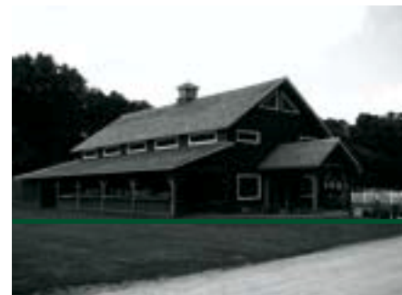
Seed Savers Exchange, Decorah