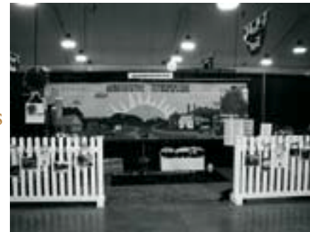
Silos & Smokestacks State Fair booth

Heritage Area volunteers traveled to Des Moines August 11-21 to participate in the Silos & Smokestacks booth at the 2005 Iowa State Fair. As one of more than 30 exhibitors in the Iowa Tourism Building, the Silos & Smokestacks booth was staffed by representatives from its partner sites, Board of Trustees, Partnership Panel, Leadership Advisors, community and Heritage Area supporters and staff.