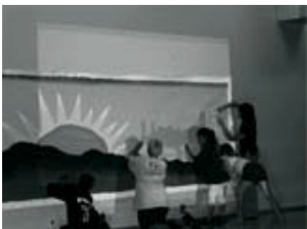
The Blue Ribbon Club beginning to paint the mural.

The finished product was an integration of rural and urban scenes and served as the focal point for the Heritage Area's booth at the Iowa State Fair.