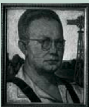
Grant Wood self portrait

The Grant Wood Studio & Visitor Center is owned and operated by the nearby Cedar Rapids Museum of Art; visit www.crma.org or call (319) 366-7503 for more information.