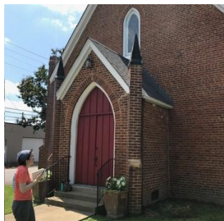
St. Thomas Episcopal Church