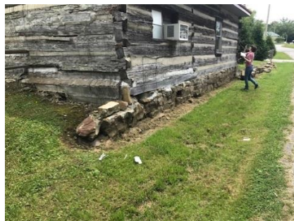
Northcutt House Cabin