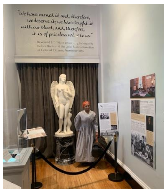
Another major Middle Tennessee project was the funding support for the "Upon the Toils of Many" exhibit at the National Register-listed Belmont Mansion, one of the key properties associated with Nashville's Civil War and Reconstruction stories.