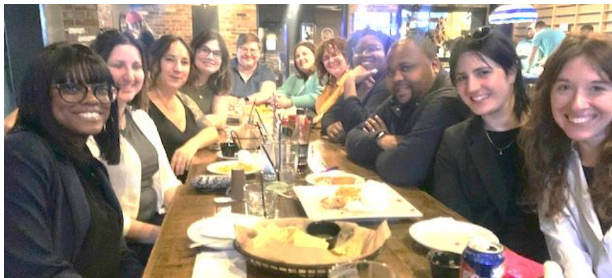
Center Graduate Assistants, past and present, gather together at 2024 NCPH Conference