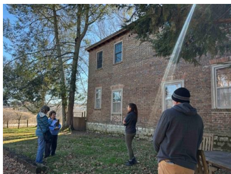
Fox Run Farm, a National Register-listed farm in Bedford County.