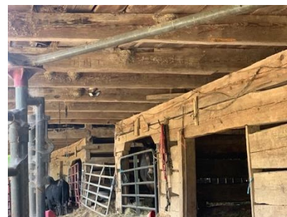
McMahan cantilevered barn