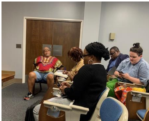
Work Session at UNC, Wilmington campus