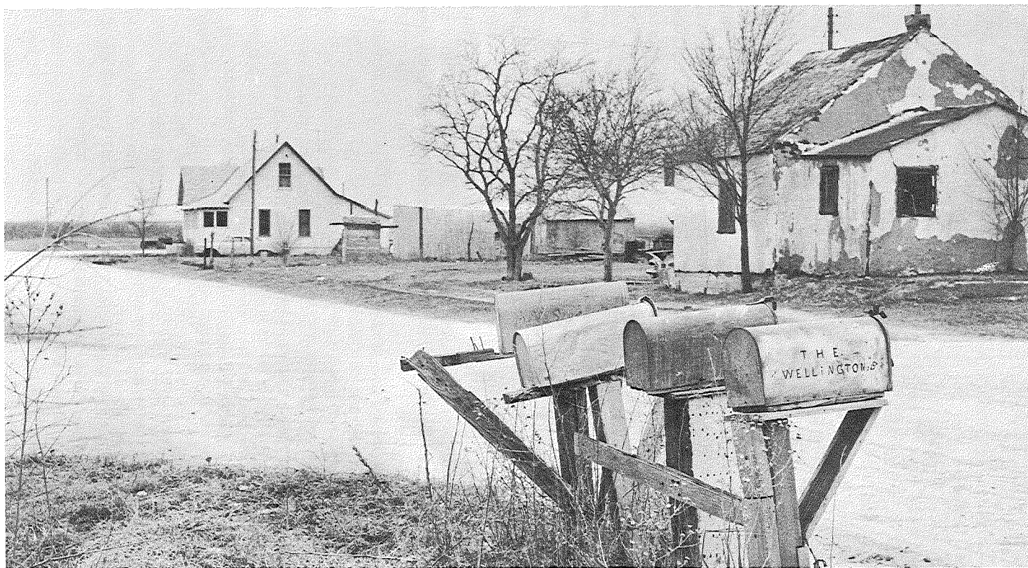
Nicodemus, Kansas, as it appears today. Although the population has declined from more than 400 in 1880 to only ten families today, the residents have high hopes for future growth.