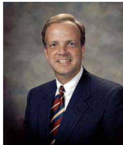
tracking the entire world

I am proud of this community. Nicodemus deserves to be honored for its contributions to American history. I commend and encourage the preservation efforts of the National Park Service and the residents of this amazing town.”