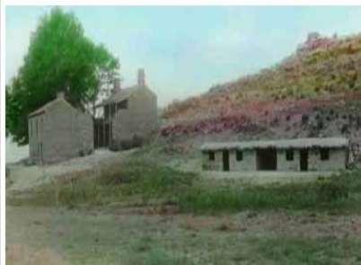
Pipe Spring National Monument

To learn more about Pipe Spring National Monument visit their National Park Service website at http://www.nps.gov/pisp .