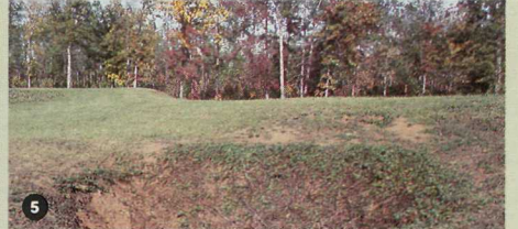
Views of old Ninety Six today: 1. The star fort. 2. The stockade fort on the west. 3. Restored