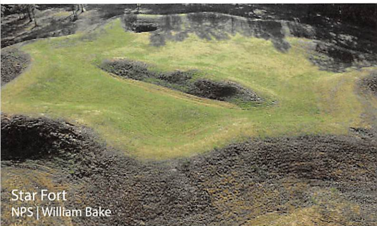
Star Fort

Ninety Six National Historic Site is an area of unique historical significance. Several theories exist about its unusual name. One explanation is that English traders in the early 1700's estimated it to be 96 miles to the Cherokee village of Keowee in the upper South Carolina foothills.