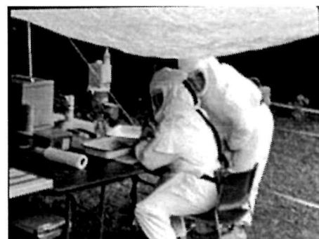
Testing rodents for hantavirus at Rock Creek NP

The NPS Integrated Pest Management Program (IPM), viewed as a model by other resource agencies in managing pest species, continues to provide a broad range of technical services and IPM training in FY 2001. The IPM Program provides low risk strategies for the management of exotic and native pests adversely affecting park management objectives through training and technical assistance. This technical assistance is provided to more than 100 parks per year through on site consultations by IPM staff,