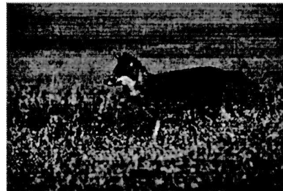
Island fox at Channel Islands NP

The Endangered Species Program is working closely with the Smithsonian Institution to provide more efficient curation of specimens collected in national parks and is also working on a new program to preserve seeds from endangered plants with the National Seed Storage Laboratory and Center for Plant Conservation. Program endangered species biologists have provided technical assistance to park units from coast to coast, including