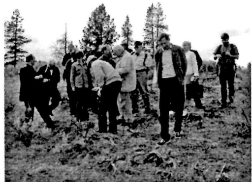
"During a field trip to see North American bison in native habitats of Yellowstone National Park, visiting Russian scientists examine particles of obsidian, indicative of the park's volcanic history, on soil surface of Hayden Valley."

Collaborative work with former biodefense scientists in Russia is being explored to benefit our natural resources. Highly trained Russian biodefense scientists who may otherwise be directed toward risky projects now have a positive alternative--a new Russian-U.S. cooperative research program that assists scientists in applying their knowledge toward useful non-military projects. Planning is underway on a multi-tiered project that will have Russian scientists applying their expertise with brucella vaccines, vaccine enhancers, and delivery systems to address bison brucellosis management at Yellowstone National Park. The Biological Resource Management Division provided technical assistance to Yellowstone National Park in initiating this collaborative work that will be sponsored by the US Department of Defense and the Nuclear Threat Initiative.