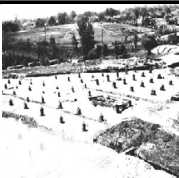
(ARCHAEOLOGISTS AT THE TRADING POST SITE)

Numerous artifacts and outlines of small building sites reflected several cultural eras that existed before, and probably after, the post was destroyed. Historic articles collected included gun parts, flints, musket balls, glass jar shreds, beads, kaolin pipes,