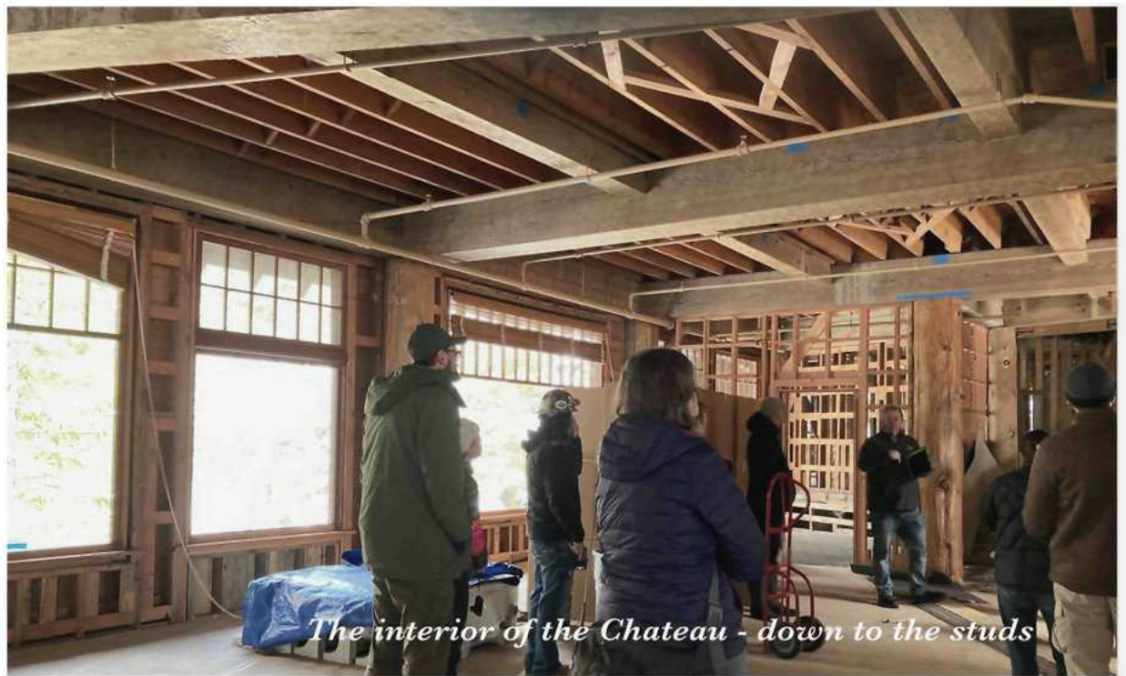
The interior of the Chateau - down to the studs

While there is much forward momentum, more effort is needed to educate all Oregonians about the value and importance of the Chateau to collectively advocate for its complete restoration. We need to show overwhelmingly that Oregonian's care and demand that this historic lodge be restored to become a successful historic grand lodge once again. It will take everyone to support this sustained effort.