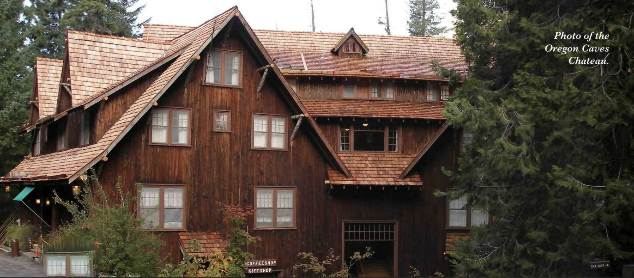
Photo of the Oregon Caves Chateau.