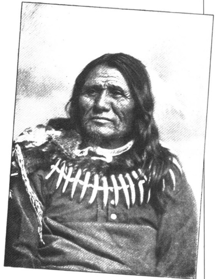
Grim and determined, Chief Standing Bear of the Poncas.

The march over the Blue Mountains was a weary and painful one, with snow falling much of the time. At the Grande Ronde River the party encountered the ambulances and wagons sent out from the fort with an abundance of