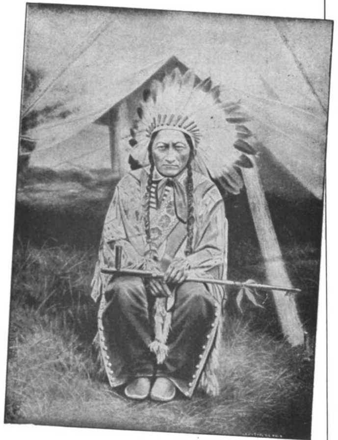
One of the most feared Indians, Sioux Chief Sitting Bull.