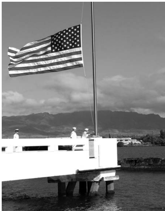
U.S.S. UTAH ASSOCIATION