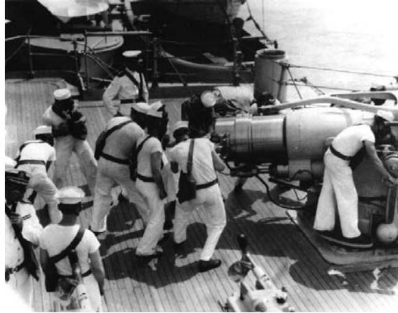
U.S. NAVAL HISTORICAL CENTER

major powers were suffering from postwar financial depression. For the United States, the treaty resulted in the scrapping of many older battleships and the cancellation of future battleships. It left the United States Navy on equal footing with the British Royal Navy with both having numerical superiority over the Japanese Navy. A mandated ten-year moratorium on capital ship building followed.