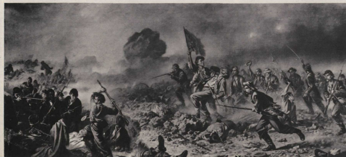
The Battle of the Crater.

Union troops easily occupied the crater. Had the infantry attack through this breach in the Confederate line been executed as planned, Petersburg might have been captured. But the Union attack after the explosion was attended by a series of blunders and much confusion. In the early afternoon, the Confederates regained possession of the crater. At this battle the Union Army lost 4,000 men killed, wounded, or captured.