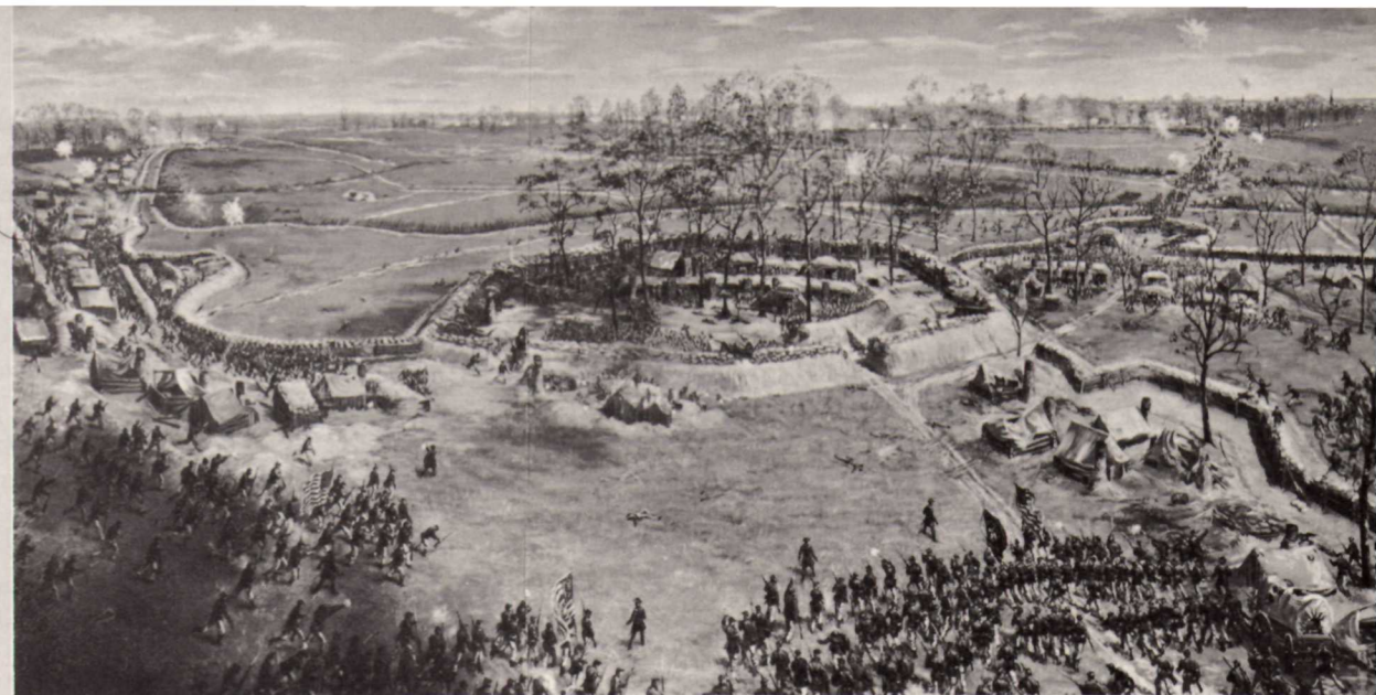
Federal troops regain Fort Stedman, thus foiling "Lee's Last Grand Offensive." From the painting by Sidney King.

In the evening, the Confederates began crossing to the north side of the Appomattox River at Petersburg, the only way still open for retreat. By dawn the next morning, when the Union soldiers resumed the attack, Lee's Army was out of Petersburg north of the river and marching west, headed for the Richmond and Danville Railroad. Petersburg had fallen, but at a heavy price. The 10-month campaign cost the Union 42,000 casual-