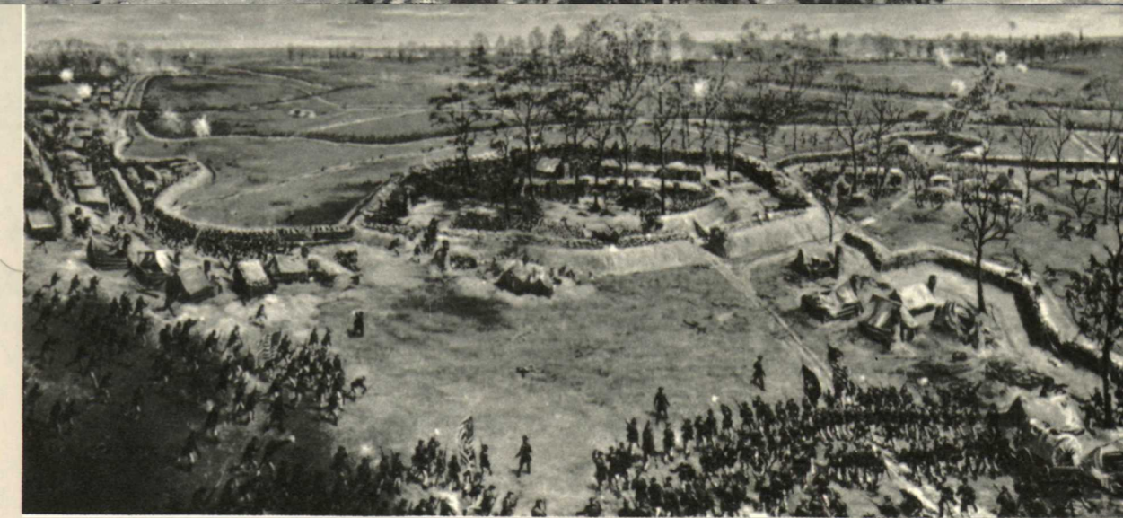
Federal troops regain Fort Stedman, thus foiling "Lee's Last Grand Offensive." From a painting by Sidney King.

ties; the Confederacy suffered losses of 28,000. Appomattox—and final surrender—was now only a week away.