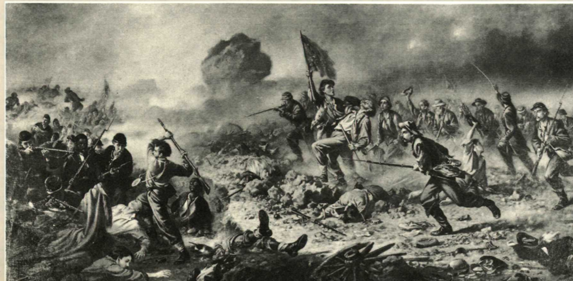
The Battle of the Crater. From the painting by John A. Elder.

Union troops easily occupied the crater. Had the infantry attack through this breach in the Confederate line been executed as planned, Petersburg might have been captured. But the Union attack after the explosion was attended by a series of blunders and much confusion. In the early afternoon, the Confederates regained possession of the crater. At this battle the Union Army lost 4,000 men killed, wounded, or captured.