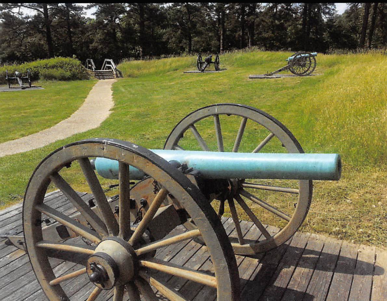
Confederate Battery V of the Petersburg Dimmock (Defense) Line

"Petersburg... guardian to Richmond's lifeline to the Southern Heartland."