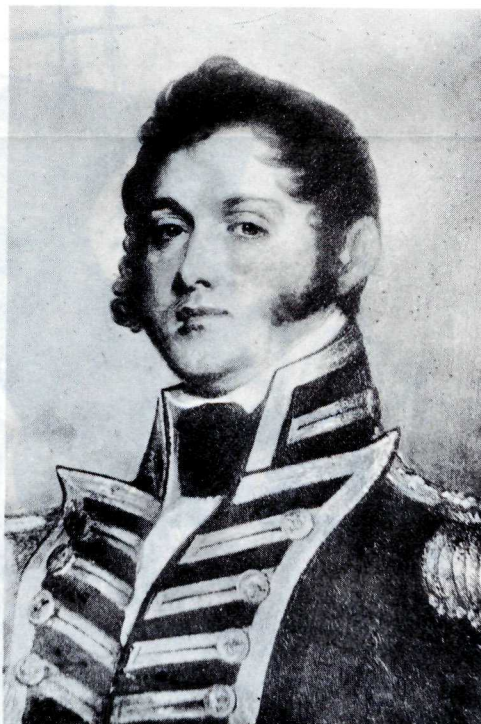
Commodore Oliver Hazard Perry, by Gilbert Stuart (1818).

Yours, with great respect and esteem O.H. Perry.