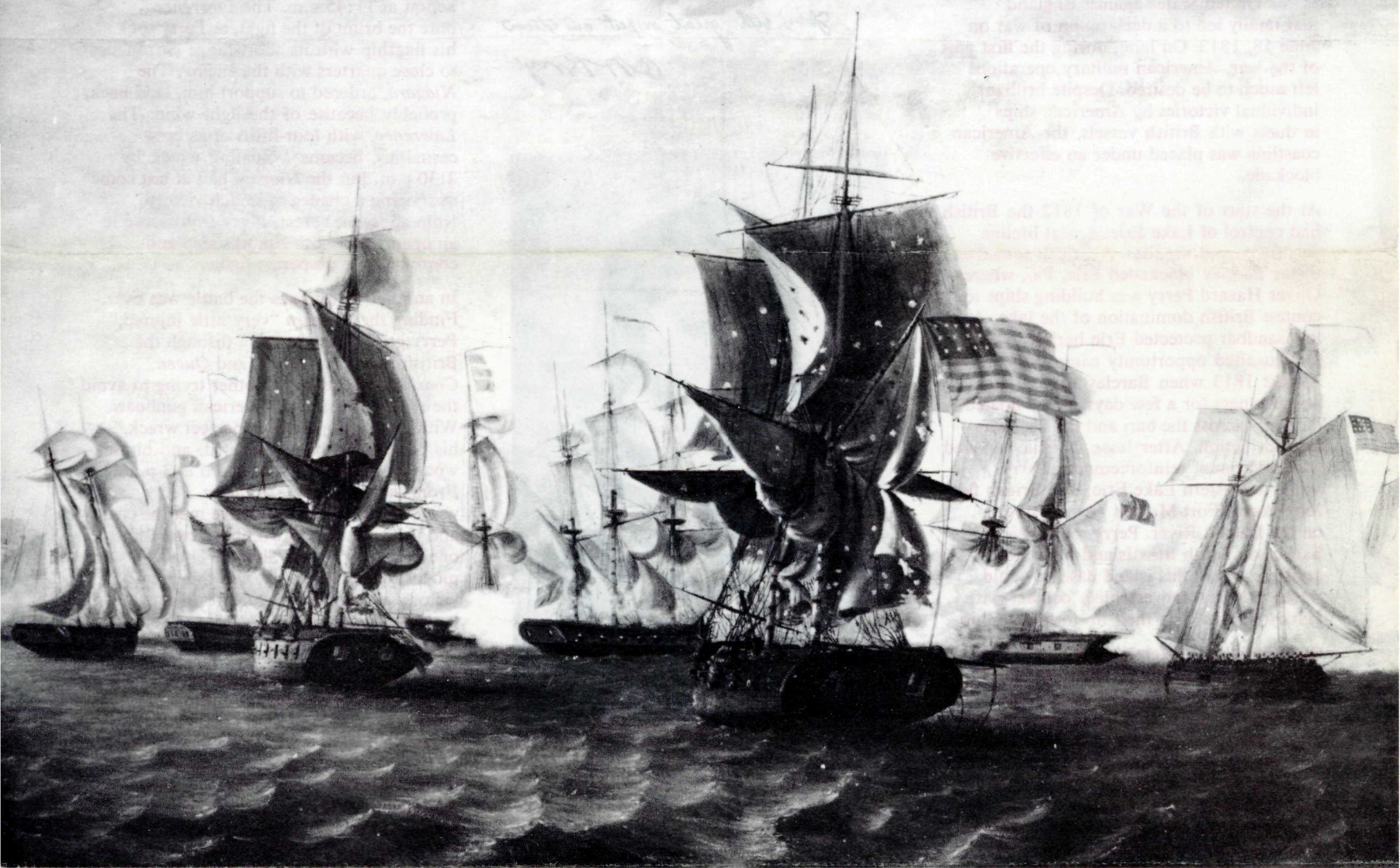
From the painting "Battle of Lake Erie" by Thomas Birch (1779-1851).

In the Battle of Lake Erie, September 10, 1813, Oliver Hazard Perry won a decisive victory over a British naval squadron commanded by Capt. Robert H. Barclay. That action (see the other side of this folder for the story) had far-reaching effects on the War of 1812 and the future of the United States, for it gave the Americans control of Lake Erie and made possible a successful advance into Canada by an American army under the command of Gen. William Henry Harrison.