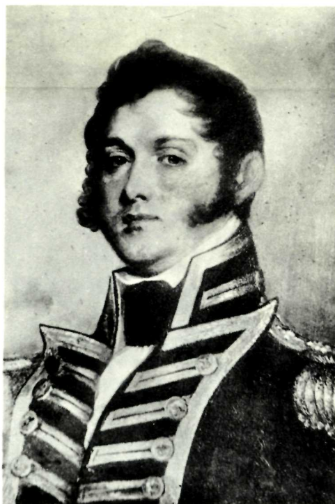
Commodore Oliver Hazard Perry, by Gilbert Stuart (1818).

In hand on the enemy and they are ours. Two Ships, two Brigs one Schooner & one Sloop. Yours, with great respect and esteem O. H. Perry.