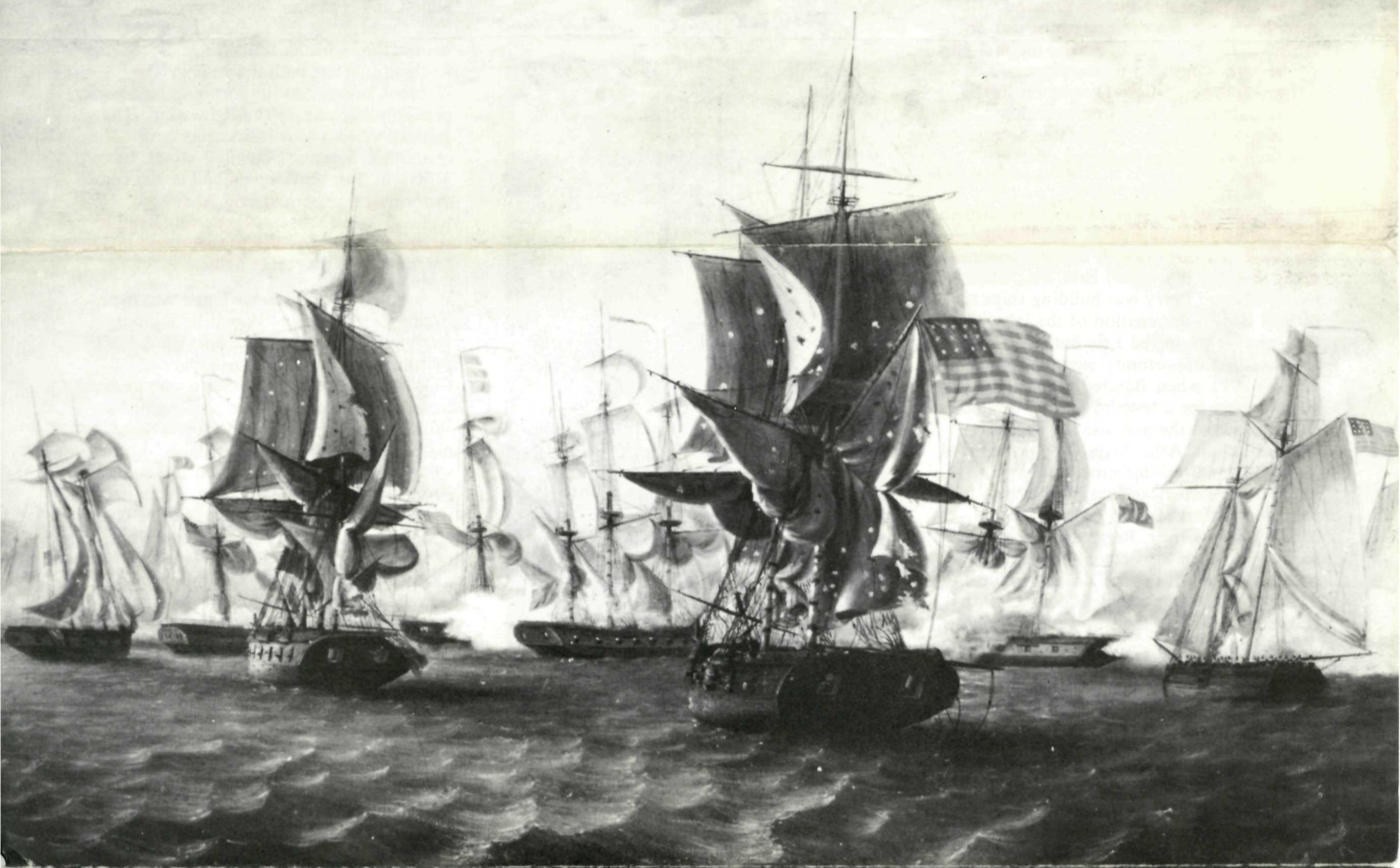
From the painting "Battle of Lake Erie" by Thomas Birch (1779-1851).

In the Battle of Lake Erie, September 10, 1813, Oliver Hazard Perry won a decisive victory over a British naval squadron commanded by Capt. Robert H. Barclay. That action (see the other side of this folder for the story) had far-reaching effects on the War of 1812 and the future of the United States, for it gave the Americans control of Lake Erie and made possible a successful advance into Canada by an American army under the command of Gen. William Henry Harrison.