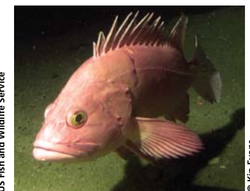
Clockwise from top left: Pacific white-sided dolphins, yelloweye rockfish, common murre, and black and yellow rockfish. These are some of the species protected under the Marine Life Protection Act.