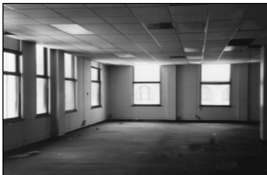
LEFT: Previously installed suspended ceiling.

When a previously installed suspended ceiling is removed as part of a rehabilitation project, the owner must either restore the original ceiling finish, or install a new ceiling that is compatible with the historic character of the building. The removal of a non-historic feature without appropriate replacement of the feature does not meet the Standards, especially in cases where the element or feature removed helps to define the original character of the space. After rehabilitation, the interior space shown in the 1915 structure illustrates the drastic change in character the space has undergone by exposing the underside of the upper floor structure and leaving the new systems exposed. Even though the original windows and historic plaster finish along the perimeter walls are still there, the character of the new interior is in contrast with the character of this historic office building which features a classically detailed masonry exterior. To meet the Standards, a new finished ceiling concealing the structural system would have to be added and the ductwork installed either above the new ceiling, or within a new soffit.