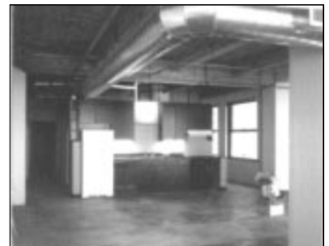
RIGHT: Photo of another area in the same building after rehabilitation. Notice how the exposed concrete floors further add to the “warehouse loft” appearance.