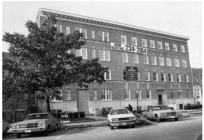
This early twentieth century apartment building was actually constructed as two buildings of harmonious but slightly different design.

However, a new floor was added that is only minimally visible on the non-significant side elevations and is imperceptible from directly across the street. Setting the new floor into the flat roof plane lowered the profile of the addition to the height of a half story. The slanted front edge further minimized the appearance of the addition and concealed integral skylights. The mass blended with the solid, unadorned side walls of the historic building. This rooftop addition does not impact the historic character of the building and is in conformance with the Standards.