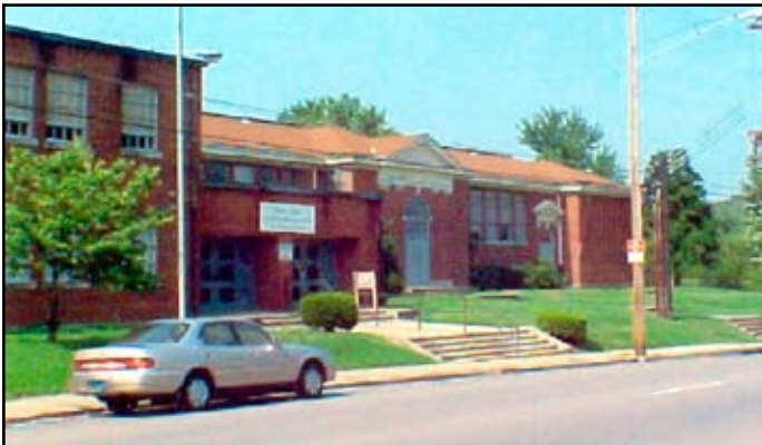
The school prior to rehabilitation.

Application 1 ( Incompatible treatment ): A school built in 1923, and expanded in later years, was proposed to be rehabilitated for continued educational use as a community