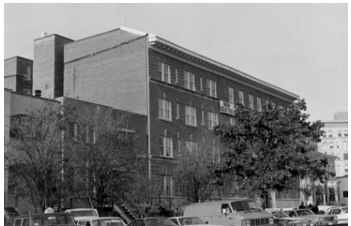
New rooftop addition and stairtower visible on the south elevation.

New rooftop addition and stairtower visible on the secondary north elevation, meets the Standards, and is compatible with the historic building.