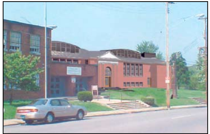
Proposed rooftop additions to school building.

resource center, a housing complex for senior citizens, a day school, and a boarding school. The building was less than three stories, sat prominently on the street and was visible on all elevations. Under the initial proposal, boarding students would live in the historically unoccupied attic of the original, 1923, portion of the school.