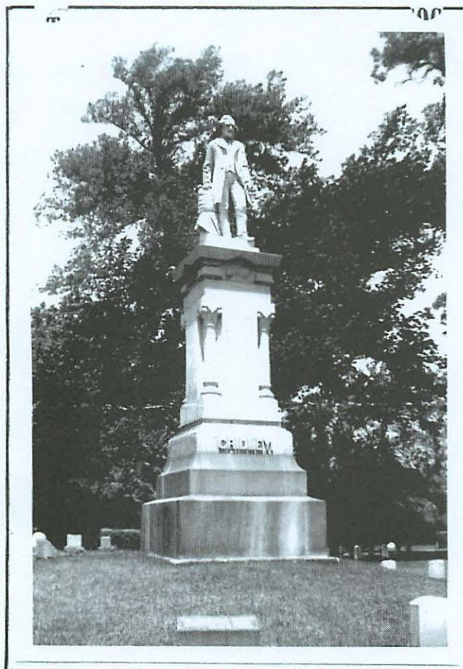
REUEL COLT GRIDLEY

Reuel Colt Gridley and his sack of flour are credited with saving the Sanitary Commission during the Civil War.