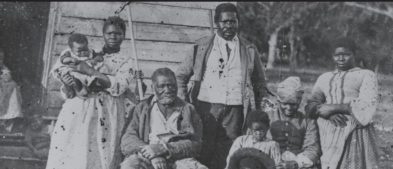
Five Generations on Smith's Plantation, Beaufort, South Carolina LOC Image / LC-DIG-ppmsc-00057

The Reconstruction era, 1861-1898, was the historic period in which the United States grappled with the question of how to integrate millions of newly freed African Americans into social, political, economic and labor systems. The historical events that transpired in Beaufort County, South Carolina, make it an ideal place to tell stories of experimentation, transformation, hope, accomplishment, and disappointment.