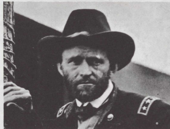
Ulysses S. Grant

In a series of flanking movements designed to cut Lee off from the Confederate capital, the Union Army slipped past the Southerners at the Wilderness and Spotsylvania Court House, although it suffered heavy casualties. At Cold Harbor, Grant's massive frontal assaults against the strongly entrenched Confederate line failed dismally with appalling losses. For 10 days the badly bruised Federals and starving Confederates broiled in the trenches; then Grant withdrew, crossed the James, and drove toward the important rail center of Petersburg.