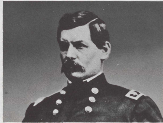
George B. McClellan

Of the seven major drives launched against Richmond, two brought Union forces almost within sight of the city—McClellan's Peninsular Campaign of 1862, culminating in the Seven Days' Battles, and Grant's crushing campaign of 1864.