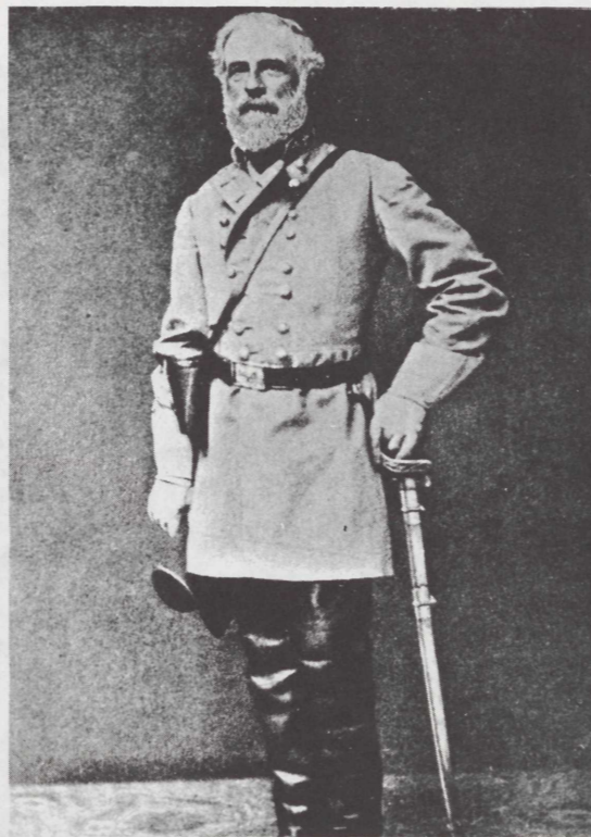
Robert E. Lee

McClellan, who had maintained his dangerous position astride the Chickahominy expecting McDowell's corps to join him, hesitated too long. On June 26 the reinforced Confederates attacked and rolled up the Union right wing at Mechanicsville, then suffered heavy losses in futile attacks against the strong Union position on Beaver Dam Creek. Thus began the Seven Days' Battles, a series of side-stepping withdrawals and bitter holding actions that climaxed the Peninsular Campaign and enabled the Union Army to avoid disaster by circling east of Richmond to the security of Federal gunboats on the James River.