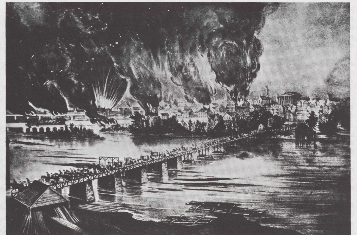
Evacuation of Richmond. From a contemporary engraving

Richmond withstood all attacks until Grant's successful siege of Petersburg forced Lee to retreat westward from that city on April 2, 1865. Richmond was abandoned the following day. Flushed from the cover of his fortifications, Lee fell prey to superior Union forces. His surrender at Appomattox Court House and the collapse of the Confederacy followed swiftly.