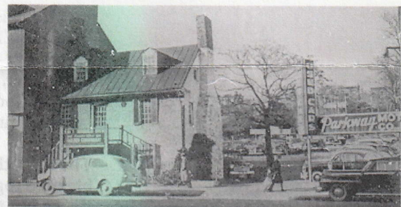
When the National Park Service purchased the Old Stone House in 1953, the house and lot were being used by the Parkway Motor Company, a used car dealership.