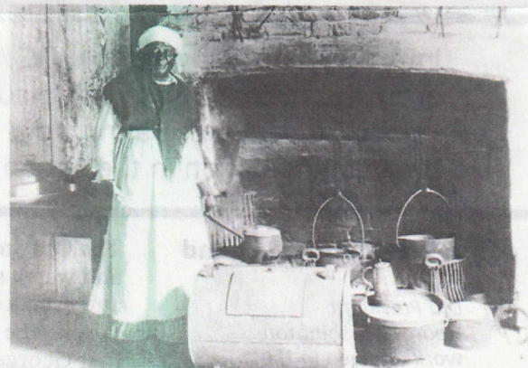
It is unclear if any enslaved people worked or lived at the Old Stone House. Yet, several women who owned the Old Stone House owned enslaved African Americans, too. For example, at the time of Mary Smith Brumley's death in 1826, records show she owned 15 enslaved African Americans. Photo not of Old Stone House.