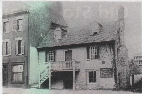
In 1766, the Layhman's lower-middle class home was simple and functional. Stone walls two to three feet thick and packed dirt floors protected the family from harsh weather while low ceilings conserved heat from the fire. By 1878, when this photograph was taken, new rooms and floors had been added to the house.

Today, Rock Creek Park, a unit of the National Park Service, manages the Old Stone House.