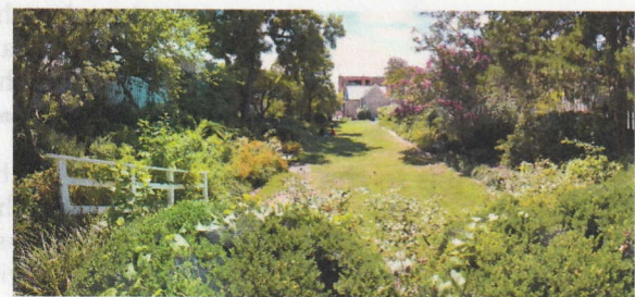
Today, the land surrounding the Old Stone House is home to an intimate English-style garden bringing green space to the heart of Georgetown.