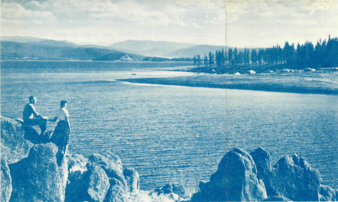
Stillwater Point, Lake Granby, looking toward the west side of the Front Range.

Camping. Locations of the three free campgrounds, Stillwater, Big Rock, and Roaring Fork, are shown on the map; however, the latter two offer only a minimum of facilities. Firewood is available for purchase from private sources. Housetrailer are permitted in the campgrounds at designated sites.