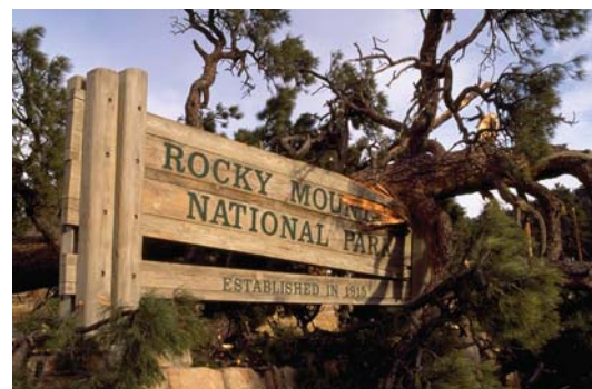
The damage to this sign on Hwy 36 is one example of how wind can impact human activities in the park.

Wind is one of the most significant environmental factors influencing plants, animals, fire, and air quality. Strong and erratic winds, characteristic of alpine and subalpine ecosystems, also affect the comfort and safety of visitors. Understanding the characteristics of wind in the park may provide valuable information to visitors or even enable the early morning prediction of severe afternoon storms. Additionally at the time this project was undertaken (1980), the park was interested in assessing the feasibility of using wind turbines to produce electricity at facilities such as the Alpine Visitor Center.