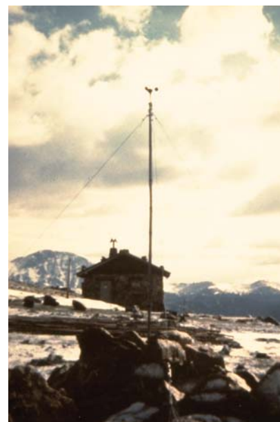
Some sites were dangerous to service due to severe wind.