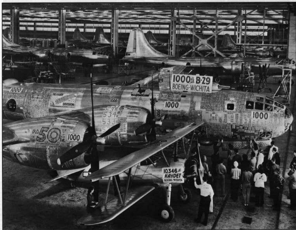
The 1000th B-29 and the 10,346th Kaydet trainer produced at Wichita's Boeing plant were presented to the Army Air Force in a ceremony on February 14, 1945. Attached to the B-29 is a coat of money—$10,000 contributed by Boeing employees to the Infantile Paralysis Foundation.