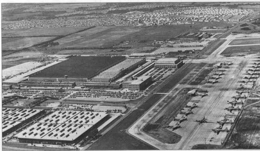
The war's conclusion in August 1945 brought an abrupt end to the jobs women held because they originally had been hired only "for the duration." In one month Boeing, shown here, laid off fifteen thousand workers from its expansive Wichita production facilities.