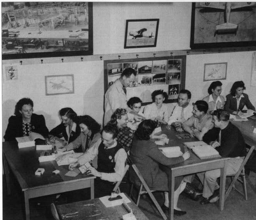
Although management expressed its doubts as to women's abilities in positions of authority, female workers proved fully capable. Women constituted a large part of this aircraft inspection class at Beech.