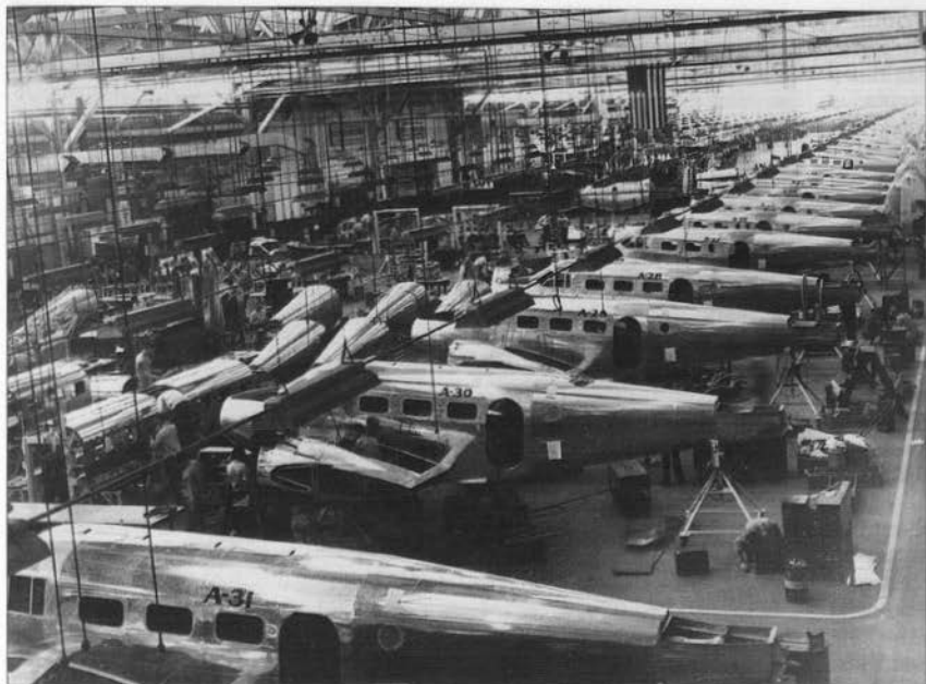
With the United States' entrance into World War II, Wichita experienced a huge jump in aircraft construction. Thousands were employed in the city's defense industries. This scene at Beech is representative of the boom in mass production also experienced by Boeing and Cessna.

building, owned by the local board of education, on North Waco Avenue in downtown Wichita. Established in late 1941, it offered courses in sheet metal work, blueprint reading, and woodwork. 5 At first, mostly men from Wichita and the surrounding area attended the school, but once the United States entered the war, an increasing number of the students were women.