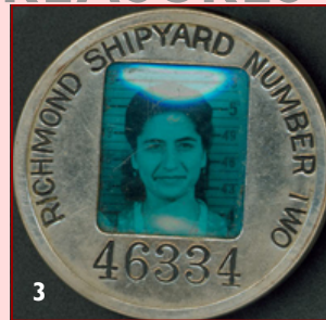
worked on the WWII home front. These items will eventually be displayed at the NPS visitor center in the Ford Building. Watch for the next issue of this newsletter, which will feature an article about the museum collection.