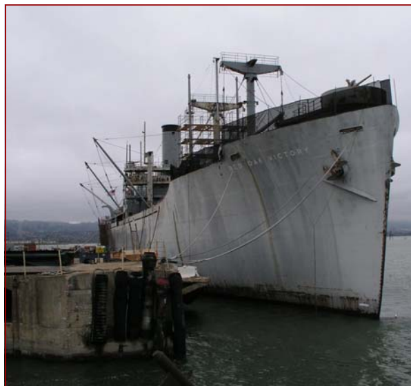
The Red Oak Victory gleams with new paint funded by a CALTRANS grant.

self-guided visits Sat., Sun., Tu., Th. 10 am – 4 pm (call ahead to confirm).