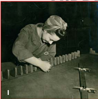
This collage shows some of the many items in the NPS museum collection, including photos, uniforms, badges, tools, and artwork that have been donated by men and women who