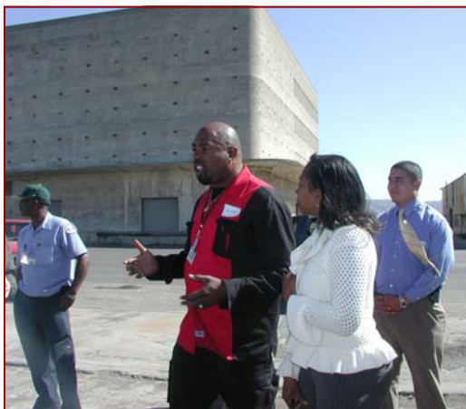
Community leaders tour historic Shipyard No. 3.

This newsletter, a joint effort by the National Park Service (NPS) and our partners, highlights NPS and partners' activities in and around the community that are bringing the national park to life. This issue will fill you in on recent activities, including exciting awards for historic preservation, inspiring