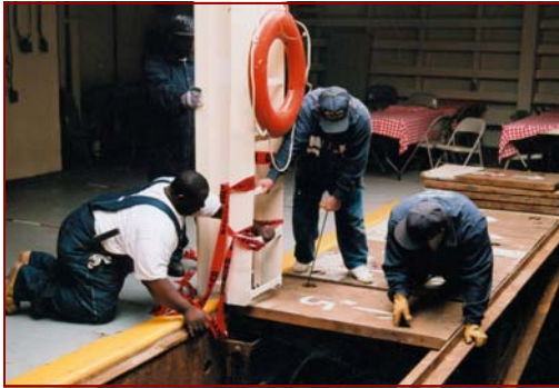
Volunteers make repairs to the SS Red Oak Victory.

toric setting. The public can visit the ship and surrounding historic sites, including the huge art-deco General Warehouse, the awesome ten-story tall Whirley Crane, and other structures built to facilitate the quick pre-assembly of ship parts—all still standing thanks to Henry J. Kaiser, who built Shipyard No. 3 as the only permanent one of four in Richmond during the war. To learn more, call 510-237-2933 or visit http://ssredoakvictory.org/ . The ship is open for