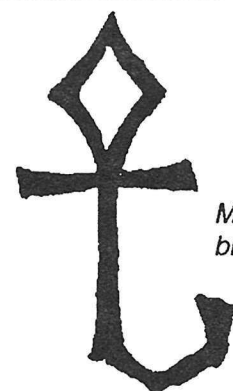
Mission Espada's brand

Horses provided transportation and the means to herd the other livestock. Cattle, sheep, goats (what few there were), and pigs provided meat. Sheep provided wool, and goats produced milk. Mules and burros were riding and pack animals.