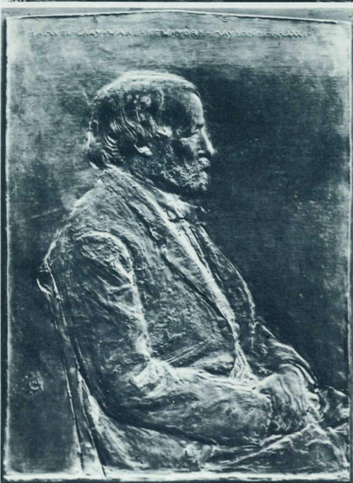
Saint-Gaudens considered this relief of Samuel Ward one of his best.