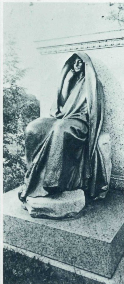
The Adams Memorial, 1891.