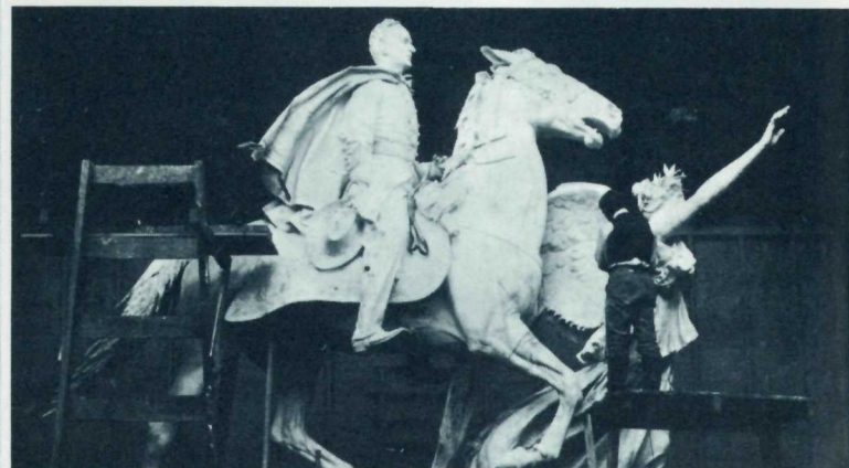
At work on the Sherman.

When the statue was exhibited in Paris in 1880 and then cast in bronze and placed in Madison Square in New York, it was quickly recognized as a landmark in American sculpture. "Here was racy characterization joined to original composition," one critic has written, "a public memorial with the stamp of creativity upon it." While Saint-Gaudens was overturning old conventions in sculpture with the figure, his collaborator, White, was contributing a new approach in pedestal design.