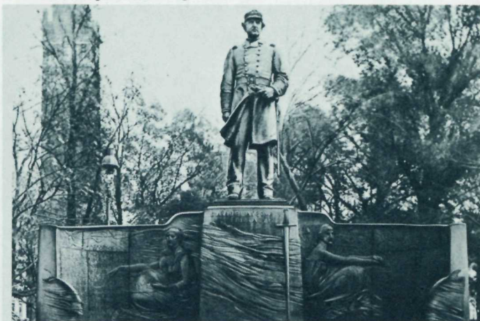
This 1881 Farragut statue brought Saint-Gaudens critical acclaim.