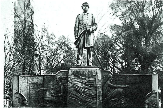
This 1881 Farragut statue brought Saint-Gaudens critical acclaim.