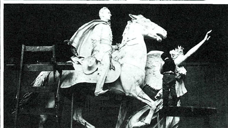
At work on the Sherman .

When the statue was exhibited in Paris in 1880 and then cast in bronze and placed in Madison Square in New York, it was quickly recognized as a landmark in American sculpture. “Here was racy characterization joined to original composition,” one critic has written, “a public memorial with the stamp of creativity upon it.” While Saint-Gaudens was overturning old conventions in sculpture with the figure, his collaborator, White, was contributing a new approach in pedestal design.