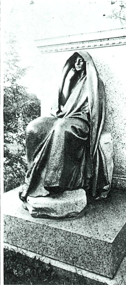
The Adams Memorial , 1891.