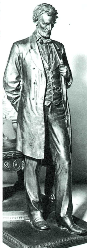
The Standing Lincoln , 1887.