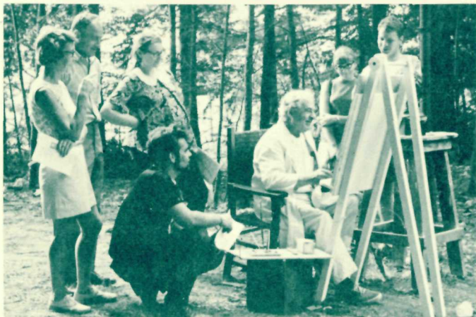
Sculptor-in-Residence at the Ravine Studio