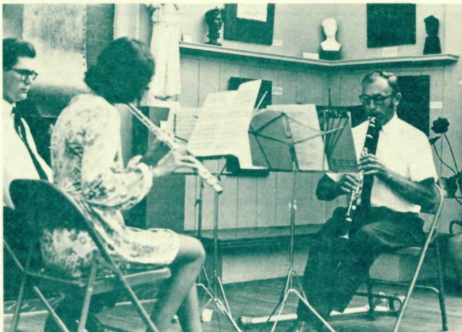
Summer Sunday Concerts sponsored by the trustees of the Saint-Gaudens Memorial