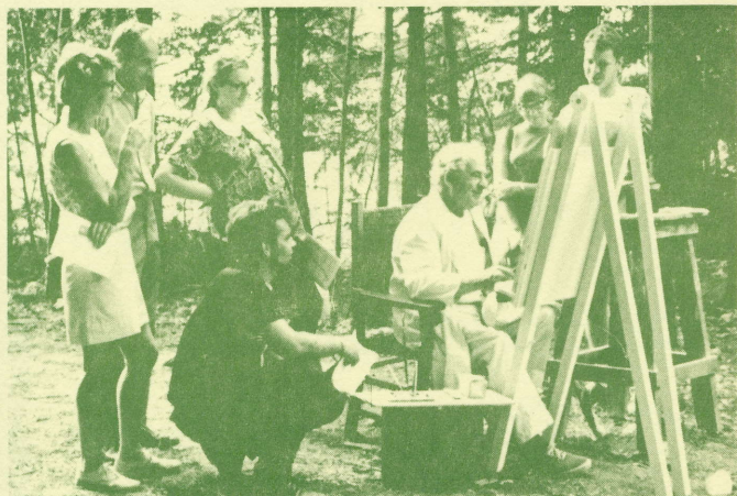
Sculptor-in-Residence at the Ravine Studio