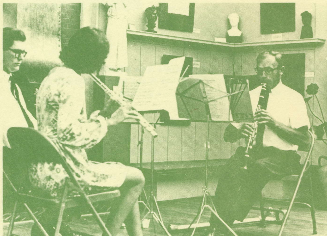
Summer Sunday Concerts sponsored by the trustees of the Saint-Gaudens Memorial