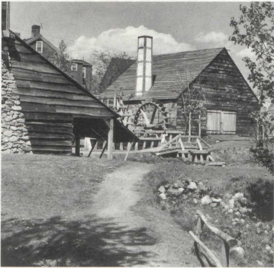
SAUGUS BLAST FURNACE AND FORGE