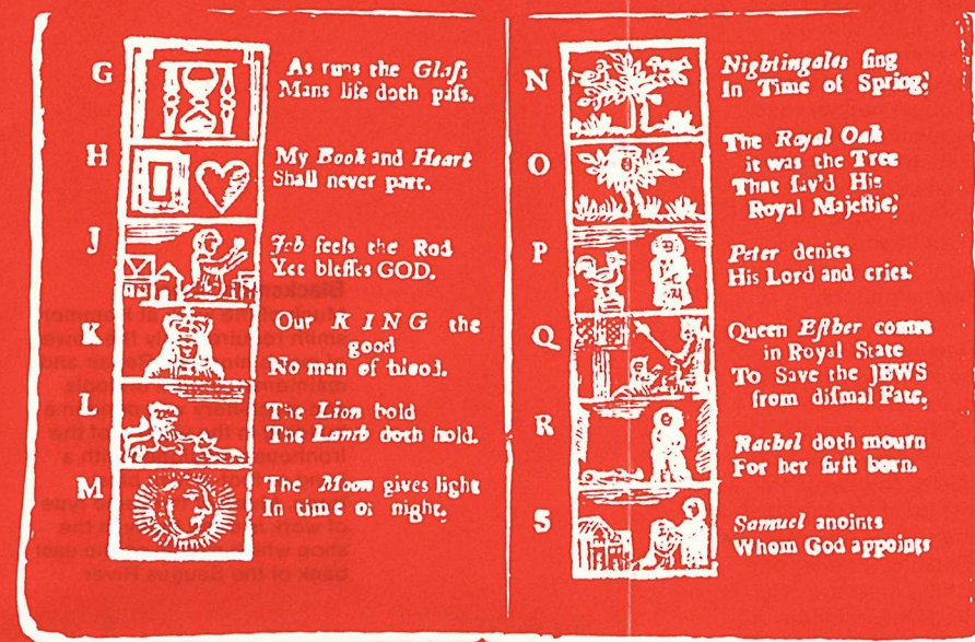
The New England Primer was just about the first schoolbook used in the New England colonies. It was first printed in the late 17th century. Strongly Protestant, the emphasis was on religion and Puritan values. The two pages above taught the alphabet with allusions to Biblical characters.