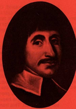
John Winthrop, Jr., (1606-1676) was the guiding light behind Saugus. The force of his personality and his determination kept the iron works going in its early years.

Most towns had public taverns where beer and spirits were freely sold. Furthermore, the New England colonists drank beer and ale at home, an entrenched custom they had brought from England, where the drinking of water was considered unhealthy. For all classes, readings from the Bible helped pass the leisure hours on Sundays. Small children could play the age-old games that children have always played, but not