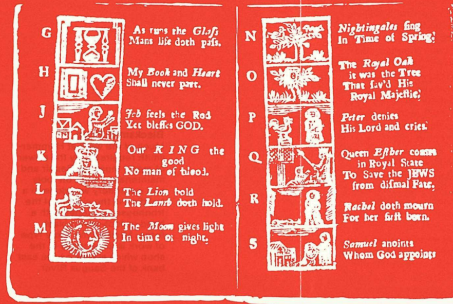
The New England Primer was just about the first schoolbook used in the New England colonies. It was first printed in the late 17th century. Strongly Protestant, the emphasis was on religion and Puritan values. The two pages above taught the alphabet with allusions to Biblical characters.