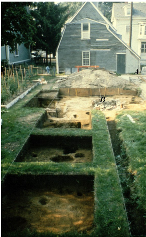
Archeological excavations pits from 1974 field season. Note "A" which is the well and "B" which is the dairy.