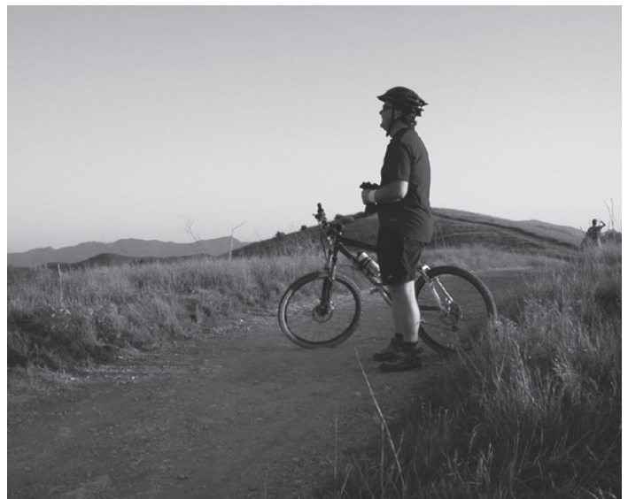
Mountain biker on Cheesboro trail.

One area of special concern in the comments was the need to provide access to parks and open space for all people to improve quality of life and foster healthy connections between people and nature, especially urban youth. Some commenters suggested that part of the significance of the Rim of the Valley study area is that it would increase the opportunities and access for urban communities currently underserved by parks and open space. Others commented that the study should evaluate opportunities to provide access to trails and natural areas for people without cars.