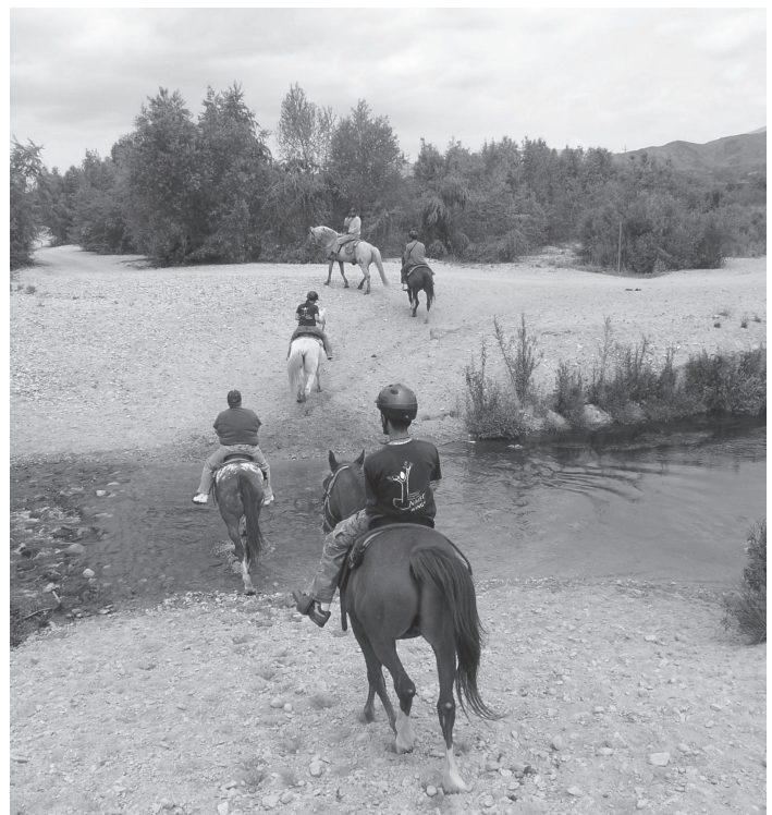
Equestrians crossing a stream near Hanson Dam.

Some commenters expressed an urgency to complete this study as soon as possible because during the years it will take to complete the study and legislate and implement the recommendations, more open space will become developed.