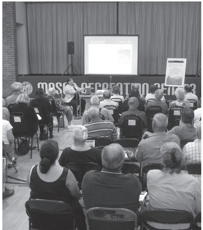
Public meeting presentation at Chatsworth, CA.