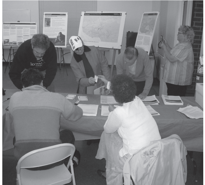
Check-in table at the public meeting in Tujunga.

The next phase of the special resource study will involve evaluation of resources within the study area to determine whether and where there are nationally significant natural or cultural resources, and to identify recreation needs and opportunities. The NPS Study team will research and evaluate these resources based on existing data, and will work with agency staff, scientists, historians, local researchers, community members, and others who know the area's resources. The resource analysis will inform the development of management alternatives which will be considered in the study.