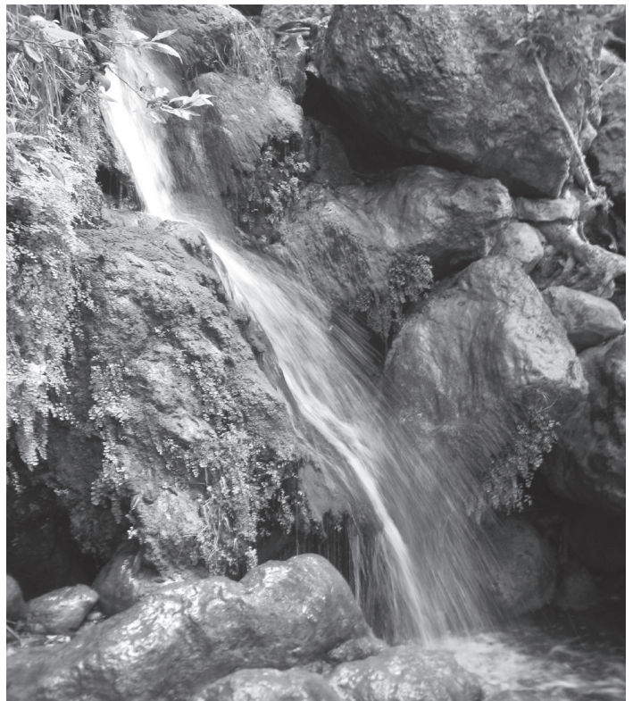
Waterfall at Solstice Canyon.

“Remember that the original concept of Rim of the Valley was to provide access to nature for underserved communities (environmental justice) part of the significance is the closeness to large urban populations.”