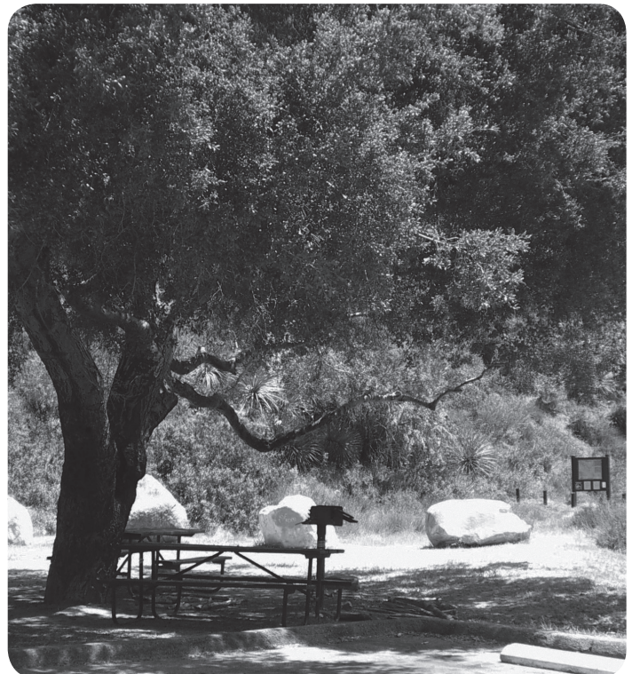
Picnic Area in Big Tujunga Canyon, Angeles National Forest.