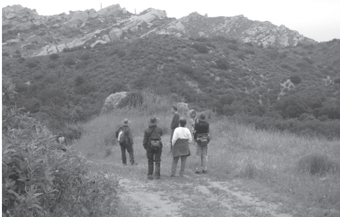
NPS study team tours the undeveloped land at the Santa Susana Field Laboratory.

“We need all the open space we can get in Southern California. Urban spaces take up so much area, and often little space is left to just enjoy the natural beauty around us.”