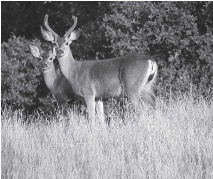
Mule deer at Paramount Ranch.

“I urge the National Park Service to fully study wildlife corridors that provide connectivity for large carnivores like mountain lions and bobcats.”