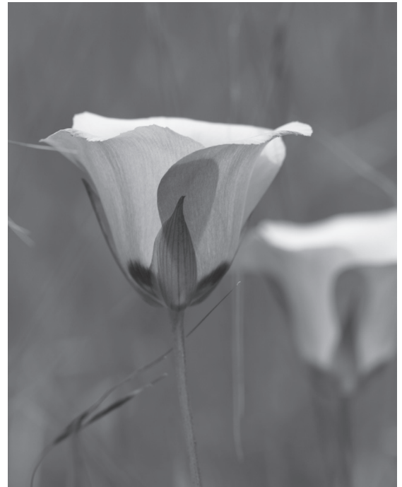
Mariposa butterfly lily.