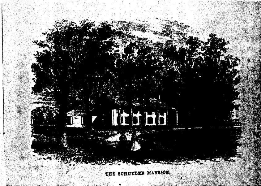
(B. Lossing, p. 90) Circa 1866

the late 1700's the the old trees and especially the lilac bushes need to be preserved as reminders of the potent past.