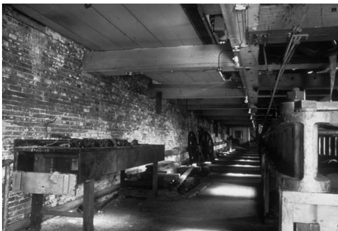
Lowell National Historical Park, Massachusetts.

the Cane River National Heritage Area features Creole and other southern cultures in a rural Louisiana setting, while the Lackawanna Valley area in northeastern Pennsylvania reveals the history and culture of a coal mining and industrial region. Such new kinds of areas involving cultural and social history have helped advance another Park Service trend that has affected most areas of the nation-