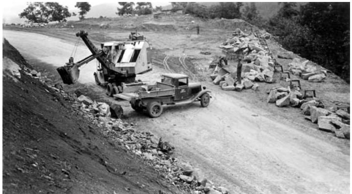
Stone guardrail under construction on Skyline Drive, early 1930s.

The visit with Roosevelt was a rare opportunity for the Park Service director, but one he had prepared for. Even before the National Park Service was established as a bureau of the Department of the Interior in 1916, Albright and key members of Congress had envisioned the Park Service taking control of all federal lands set aside for their historical associations. They planned that the Park Service would be in charge of not only ancient southwestern Indian sites managed by the U.S. Forest Service, but also historic areas under the War Department, which oversaw Civil War battlefield parks and other historic sites, including those in the nation's capital. Sites that Albright had especially wanted included battlefield parks such as Shiloh, Gettysburg, and Vicksburg; plus the Forest Service's archeological areas in the Southwest. But the 1916 act did not turn these places over to the Park Service. And by 1933, Albright was increasingly certain that such places were not being managed satisfactorily enough to fulfill the American public's desire to see them and gain a better understanding of their history and significance. The Park Service itself was convinced that, given the experience it had gained in historic site management by 1933, it could oversee these