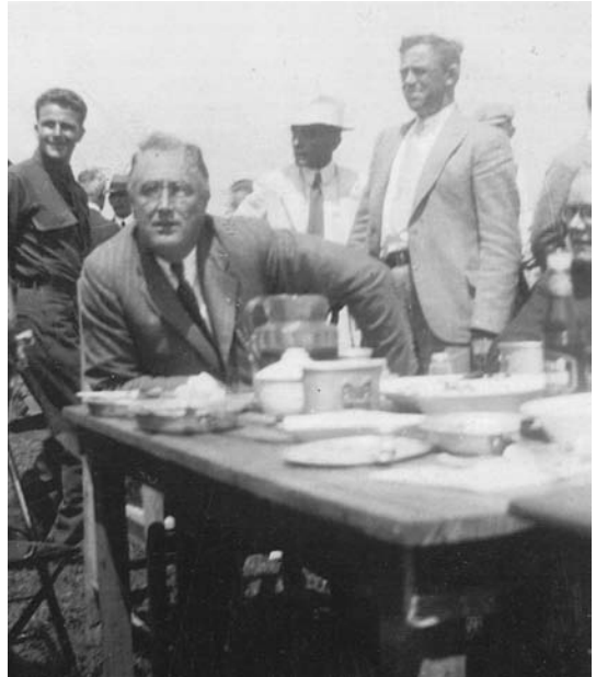
President Franklin D. Roosevelt visiting a CCC camp at Shenandoah, August 1933—about four months after his visit to the park with Horace Albright, described in the text.

By August 1933, the National Park Service had built its public status not on historic preservation, but primarily on its management of a number of large, spectacular national parks mostly in the West. Yellowstone, established in 1872, was the first, followed much later by such majestic parks as Sequoia, Yosemite, and Mount Rainier. These parks gained great renown, becoming geographical symbols of national identity and destination sites for thousands of tourists. The Park Service—much more than its management predecessors in the Department of the Interior—had worked diligently to attract people to the parks and to educate visitors about the areas’ natural history and special scenic features. To enable the public to see and enjoy the parks, the Park Service’s first director, Stephen T. Mather (Albright’s immediate predecessor) aggressively sought to develop roads, trails, camping areas, tour-bus systems, and many other facilities. Under Mather’s guidance, the parks continued to enjoy enthusiastic support from railroad companies, and then from automobile associations, all interested in promoting tourism to these extraordinarily scenic places. 2