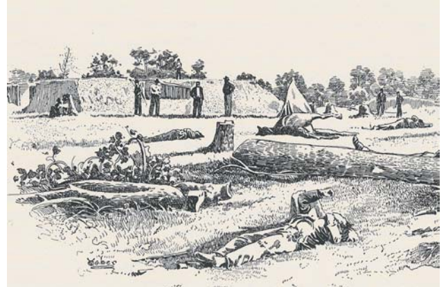
Battery Robinett shortly after the battle

During the Battle of Corinth, the fight for Robinett was bloody and desperate. A Confederate attack against the bastion resulted in a hand to hand struggle for the position. The strength of Federal defensive fortifications proved effective against the Confederate assaults.