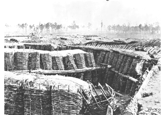
Use of gabions and fascines

battles, and occupation of Corinth. Yet, with just a little imagination, one can envision how things would have appeared to those soldiers building, manning, and fighting in these works during the Civil War.